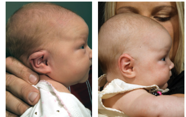
Before and After photographs provide “proof positive” that the transformative therapy of the EarWell™ auricular corrective system truly works.

Some ears do improve over time, some require surgery after the age of four or five, and some children are forced to live with their defect. Unfortunately, no physician can predict which ears will improve naturally, which ears will remain the same, and which ears will worsen. Fortunately, through EarWell™'s transformative therapy, you will never have to risk your child's future physical and emotional well-being.