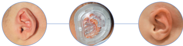
Before EarWell™ During EarWell™ therapy After EarWell™

The EarWell™ procedure is completed in just minutes, right in your doctor's office. After 4-6 weeks, the ears will be shaped normally.